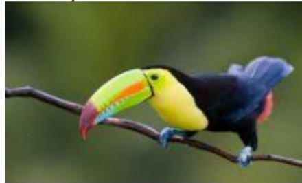
Costa Rica, 2023 An OCHBA Continuing Legal Education Travel Seminar

Hope to see you all at our Cinco de Mayo Mixer . Remember to renew your membership today to receive member prices to all our events.